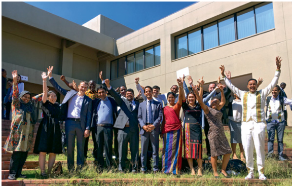
A previous PEPP cohort celebrate arriving on campus following their matriculation ceremony